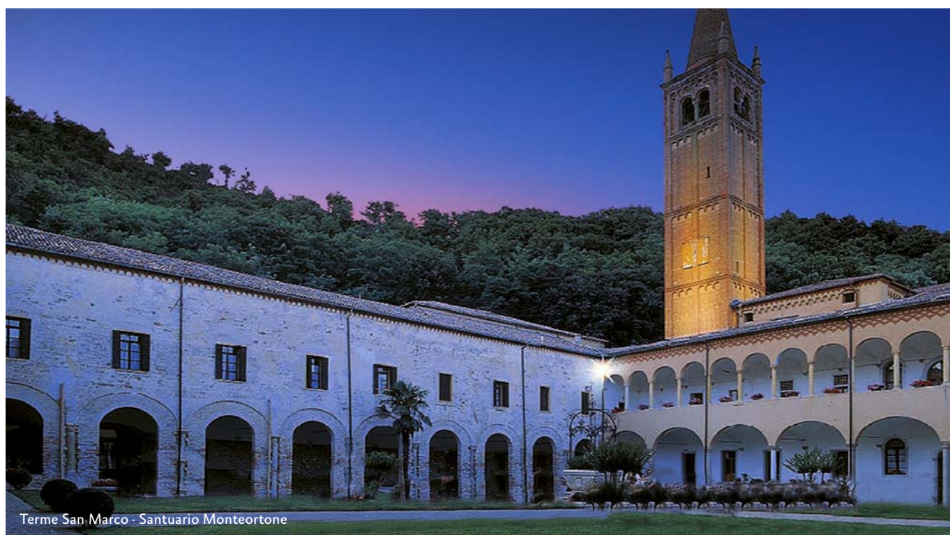
Terme San Marco - Santuario Monteortone

FOR BEGINNERS AND ALL WHO WISH TO ACQUIRE AN IN-DEPTH EXPERIENCE